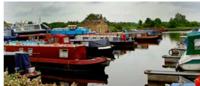
Stanley Ferry Marina

St Swithins enjoys the proximity of a cosmopolitan city and all that it offers, whilst having the benefit of a quiet suburban location. On the edge of beautiful countryside and close to an historic waterway which is still home to many house boats moored at Stanley Marina.