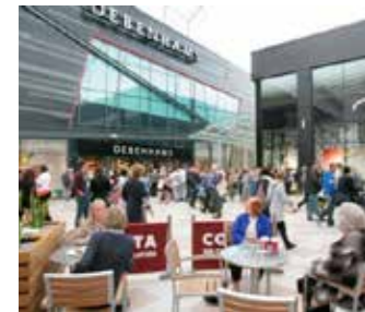
Trinity Shopping Centre

There's a good choice of primary and secondary school education. Also independent schools, such as Queen Elizabeth Grammar and Wakefield City High have excellent reputations. Wakefield College has recently undergone a modernisation programme and, like many colleges in the area, it offers a good range of vocational and higher education courses. For those wanting to study to degree level, there are plenty of established universities within travelling distance which offer graduate courses.