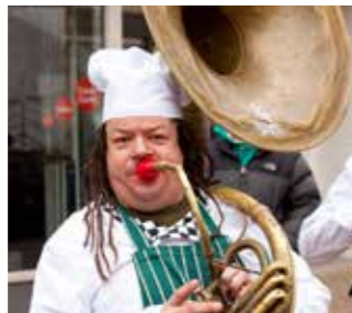
Wakefield Rhubarb Festival