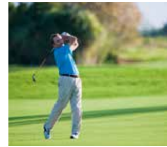
Golf clubs nearby